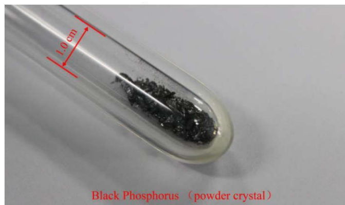
Photo of black phosphorus powder